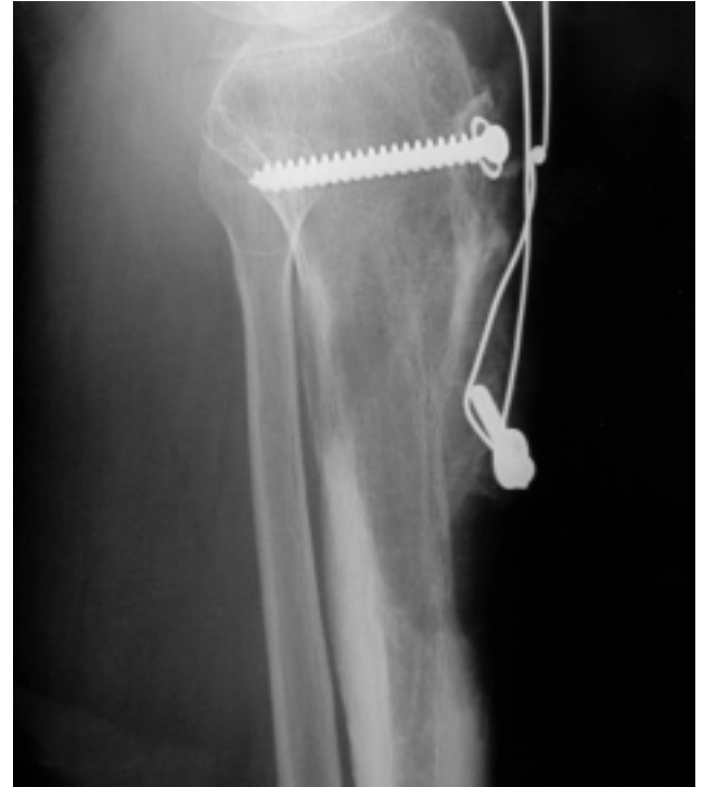
Figure 2 Lateral X-ray when patient first presented.

disease, such as bowing or advancing radiolucent wedge (Fig. 2). Bone scanning showed a focal area of diffuse increased activity around the left tibial lesion, including the patella and femur. Serum alkaline phosphatase, calcium, and phosphate levels were normal. Lactate dehydrogenase levels were marginally raised. The 24-hour urine examination showed a marginally raised hydroxyproline level of 444 \mu\text{mol}/\text{dl} (normal range, 120–320 \mu\text{mol}/\text{dl} ). A second biopsy showed the presence of irregular dilated vessels with an associated decrease in bone trabeculae. No osteoclastic activity or prominent cement lines were visible. The histological findings were thus not typical of Paget's disease and were more indicative of a vascular lesion (Fig. 3). In the light of the histological findings and the isolated bone involvement, the lesion was identified to be an unusual form of skeletal angiomatosis that involved one single osseous site, with associated osteolysis. Further progression of the osteolysis was evident during the observation period, and a course of palmidronate was used in an attempt to halt the disease process. The patient was given 60 mg intravenous infusion of palmidronate over one hour. He was also given supplement of calcium carbonate