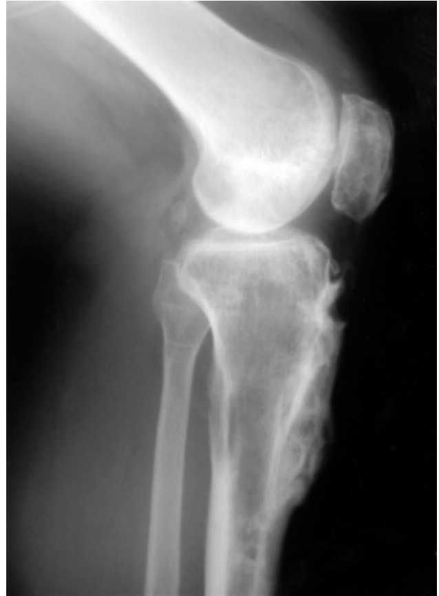
Figure 5 Lateral X-ray at 3-year follow-up showing good formation of bone at the affected site.

Spontaneous avulsion fracture of the tibial tuberosity in adults is uncommon and, in this case, occurred in