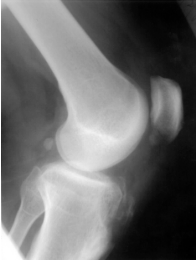
Figure 1 Lateral X-ray of the left knee, showing avulsion of tibial tubercle.

disease, such as bowing or advancing radiolucent wedge (Fig. 2). Bone scanning showed a focal area of diffuse increased activity around the left tibial lesion, including the patella and femur. Serum alkaline phosphatase, calcium, and phosphate levels were normal. Lactate dehydrogenase levels were marginally raised. The 24-hour urine examination showed a marginally raised hydroxyproline level of 444 \mu\text{mol}/\text{dl} (normal range, 120–320 \mu\text{mol}/\text{dl} ). A second biopsy showed the presence of irregular dilated vessels with an associated decrease in bone trabeculae. No osteoclastic activity or prominent cement lines were visible. The histological findings were thus not typical of Paget's disease and were more indicative of a vascular lesion (Fig. 3). In the light of the histological findings and the isolated bone involvement, the lesion was identified to be an unusual form of skeletal angiomatosis that involved one single osseous site, with associated osteolysis. Further progression of the osteolysis was evident during the observation period, and a course of palmidronate was used in an attempt to halt the disease process. The patient was given 60 mg intravenous infusion of palmidronate over one hour. He was also given supplement of calcium carbonate